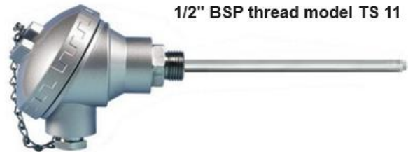
1/2" BSP thread model TS 11