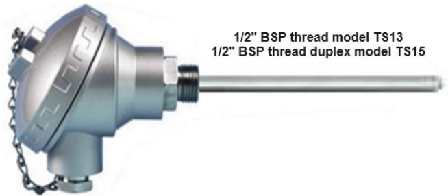
1/2" BSP thread model TS13 1/2" BSP thread duplex model TS15